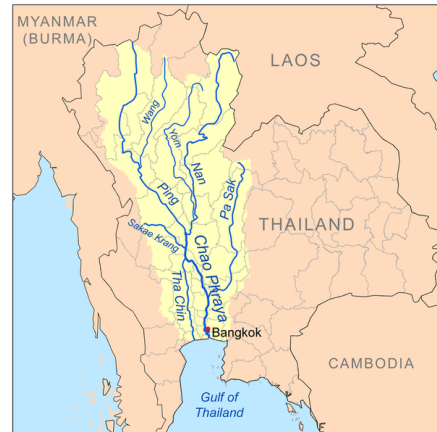
The Chao Phraya River System.

A simplified model of this river system is shown in Figure F.1, where the smaller red numbers indicate the lengths of various sections of each river. The point where two or more rivers meet as they flow downstream is called a confluence . Confluences are labeled with the larger black numbers. In this model, each river either ends at a confluence or flows into the sea, which is labeled with the special confluence number 0. When two or more rivers meet at a confluence (other than confluence 0), the resulting merged river takes the name of one of those rivers. For example, the Ping and the Wang meet at confluence 1 with the resulting merged river retaining the name Ping. With this naming, the Ping has length 658 km while the Wang is only 335 km. If instead the merged river had been named Wang, then the length of the Wang would be 688 km while the length of the Ping would be only 305 km.